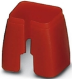
Color marking for patch cable, red

Please be informed that the data shown in this PDF Document is generated from our Online Catalog. Please find the complete data in the user's documentation. Our General Terms of Use for Downloads are valid ( http://phoenixcontact.com/download )